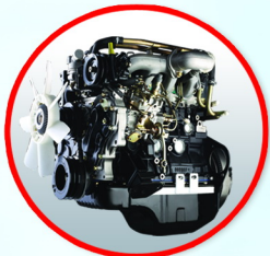
2771cc Natural Aspirated Diesel Engine