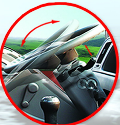
Power Steering with Tilt steering column